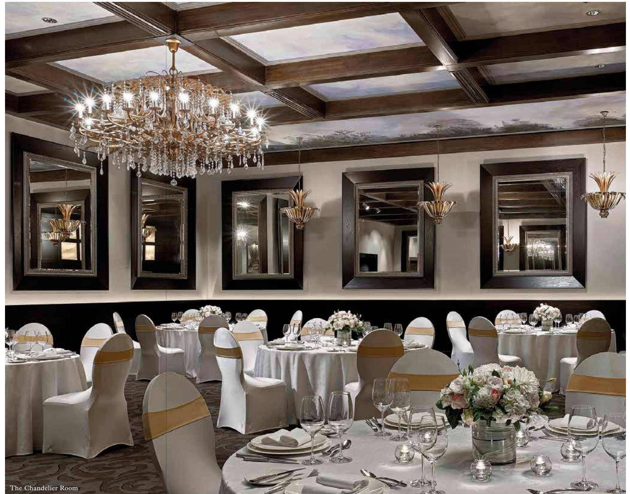
The Chandelier Room

— For reservations or enquiries, please contact our events specialists T +64 (9) 300 2901