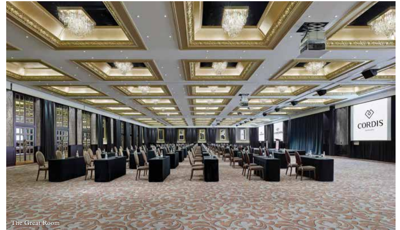
The Great Room

Located just off the main hotel lobby, The Boardroom has a spacious boardroom table permanently set up with executive chairs. Seating up to 12 guests, it is ideally suited for board meetings or as a secretariat.