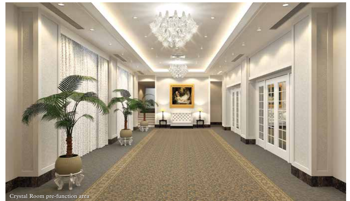
Crystal Room pre-function area