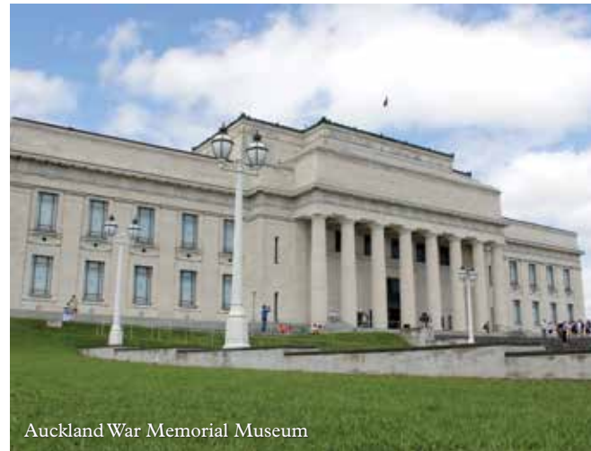
Auckland War Memorial Museum

Head to Ponsonby Road for stylish bars and people-watching on Auckland's hippest strip. Ponsonby has restaurants and bars to suit every taste. The area's newest space, Ponsonby Central, is a stylish hub of modern eateries, bars and coffee spots. Dance until the early hours or check out live music and cocktails with the most fashionable people in town.