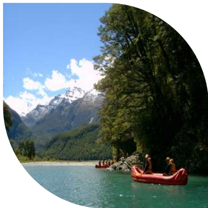
Dart River Mission