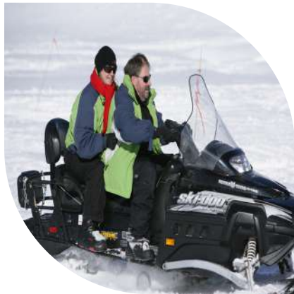
Snow Motion Day