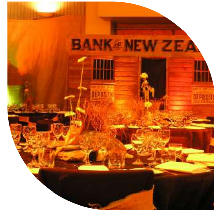
Props & Lighting