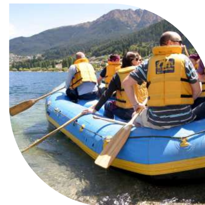
The Great Race