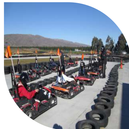
Top Gear Challenge