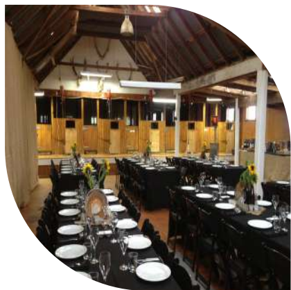
Mt Nicholas Woolshed

Here is a small smaple of some of the exclusive venues that we work with.