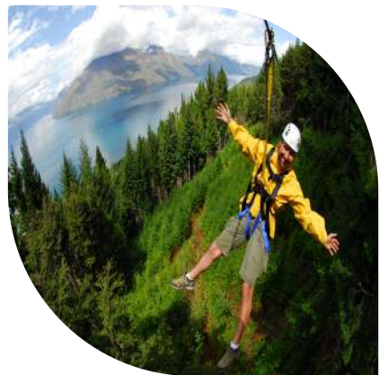
Be Bold Challenge