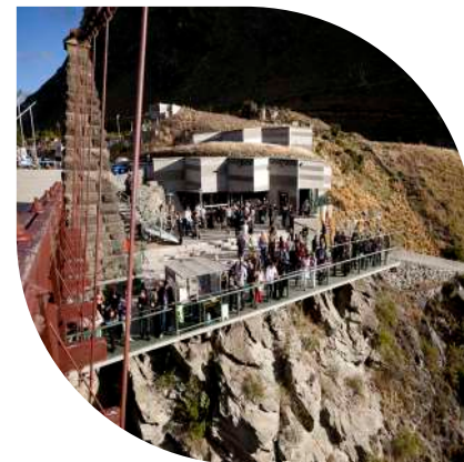
Kawarau Bungy Centre