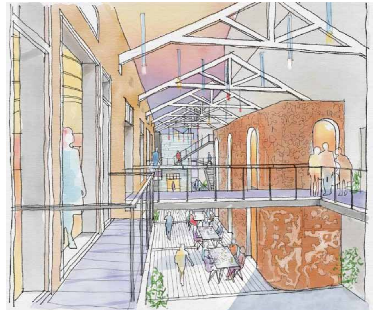
A venue like no other

The second stage of the development also includes a laneway, as well as a mix of retail tenants and newly created additional spaces available for public hire, as well as educational providers on the ground floor.