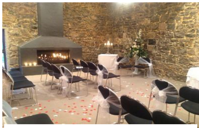
Oast House – $600 per day including gst

Located on the ground floor of hotel with magnificent bluestone feature walls & vaulted ceiling. The gas fire creates an atmosphere of warmth in comfortable surroundings.