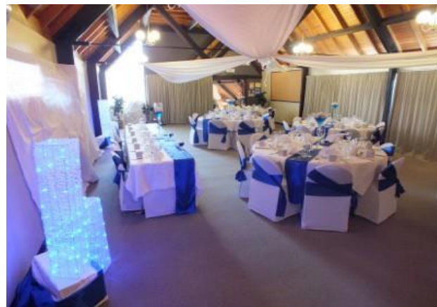
McGavin Room – $850 per day including gst

Located on the 1 st floor of the hotel, the McGavin Room is the largest dedicated function room. With natural lighting & a balcony featuring views of the spectacular gardens, this room is delightful during both the day & evening.