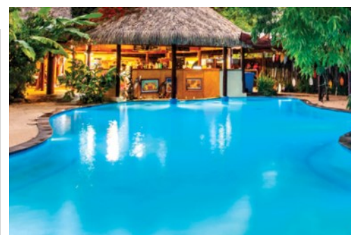
SWIMMING POOL + SWIM-UP POOL BAR