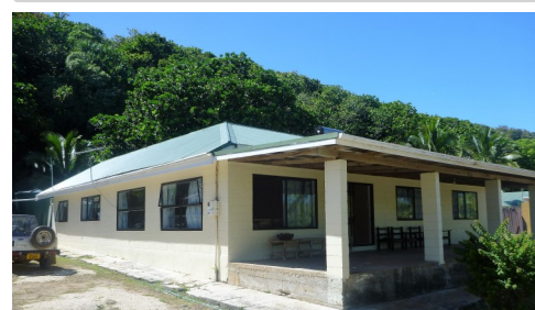
The main house - with communal facilities