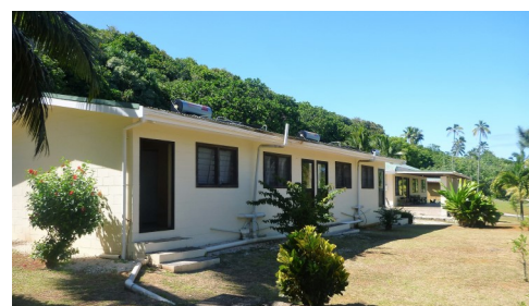
Front of the property—view from the main road