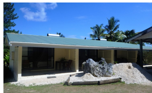
Babes place awaits you...

There are many things to do and places of interest to see and although you may explore on your own, it is best to have a local tour guide take you on an island tour as they are very knowledgeable and can share with you in the culture and history of the many sites you will visit. There are cave tours available as well as a garden tour and we can happily arrange any of these tours for you on request.