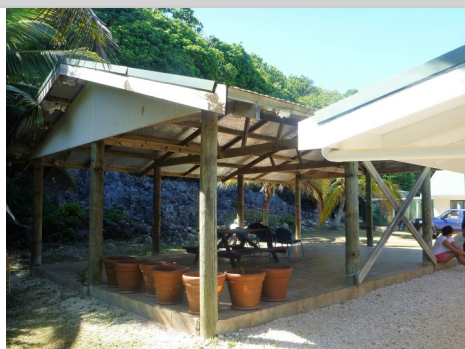
The hut is located at the back of the units