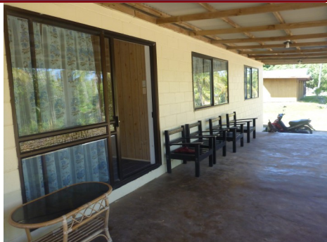
Main house where you'll find the Kitchen & Dining area, Lounge, & Laundry Facilities