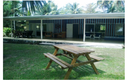
Anchors Rest awaits...

This property is perfect for bigger groups and families to enjoy some quality time together.