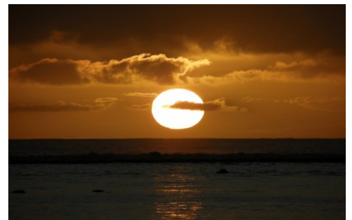
Beautiful view of the sunset