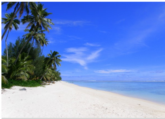
Your very own beach in your backyard