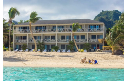
MOANA SANDS BEACHFRONT HOTEL

Moana Sands Hotel is a great choice for all travellers looking for great beachfront accommodation at a very reasonable price. Your time here will leave you feeling relaxed and rejuvenated, with fond memories of the Cooks Islands to take home with you.