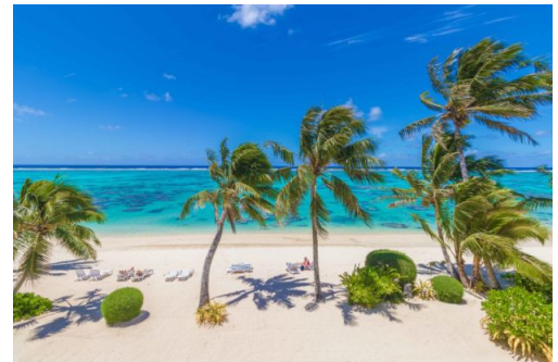
STUNNING BEACH & LAGOON