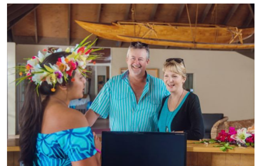
MEET & GREET AT RECEPTION

Complimentary Daily Tropical Breakfast at the onsite Restaurant and Free use of Snorkelling Gear & Kayaks