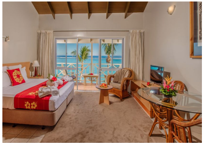
DELUXE BEACHFRONT STUDIO