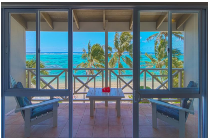
DELUXE BEACHFRONT STUDIO