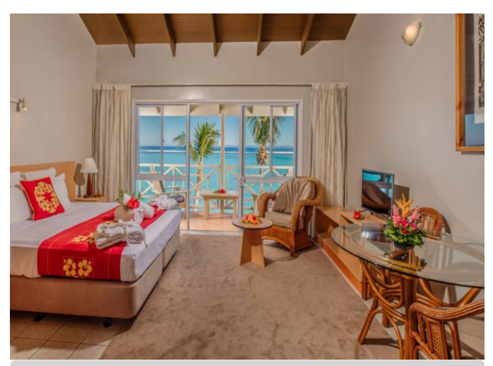
DELUXE BEACHFRONT STUDIO