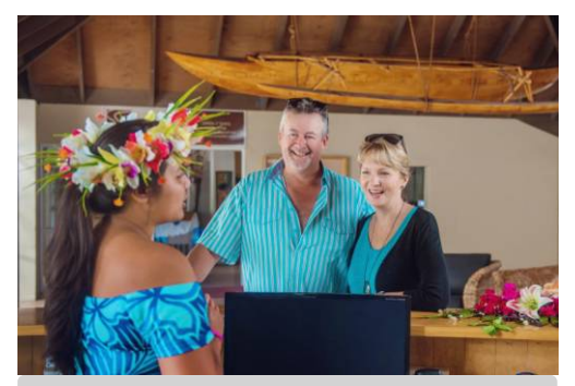
MEET & GREET AT RECEPTION