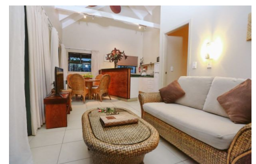
Water Garden Villa