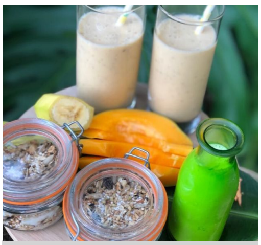
ORGANIC DAILY BREAKFAST