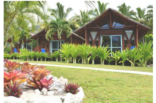
Magic Reef awaits you...

Magic Reef is 4km from the airport and within walking distance to restau-rants and shops. Set back from the main road makes Magic Reef a quiet and secluded property.