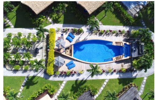
FRESH WATER SWIMMING POOL