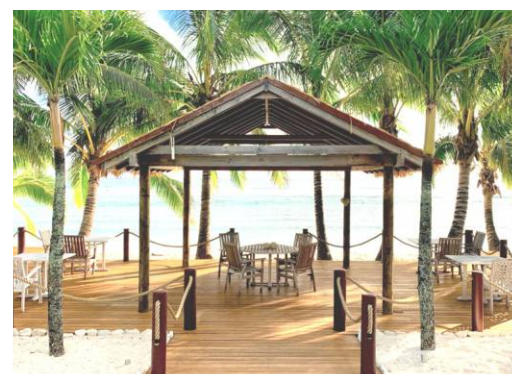
SHELTERED OUTDOOR DECK