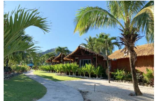
MAGIC REEF BUNGALOWS

Set back from the main road makes this stunning location a quiet and secluded property. Your time here in paradise will leave you feeling refreshed, relaxed and rejuvenated.