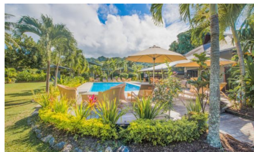
MURI BEACH RESORT

Please note that Muri Beach Resort have two price options to choose from; they have 'Daily Service Rates' which includes Complimentary Daily Full Breakfast as well as Housekeeping and the 'Self Service Rates' which includes Complimentary Breakfast on your first day of arrival only.