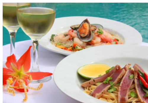
MOUTHWATERING SEAFOOD DISHES AT AQUA RESTAURANT