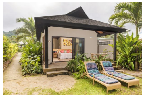
STYLISHLY APPOINTED VILLAS