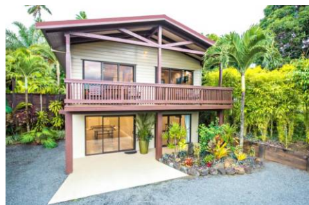
Lagoon View Executive Villa