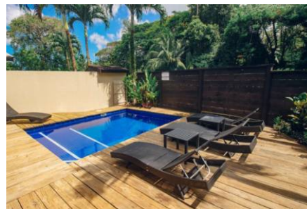
LAGOON VIEW EXECUTIVE VILLAS