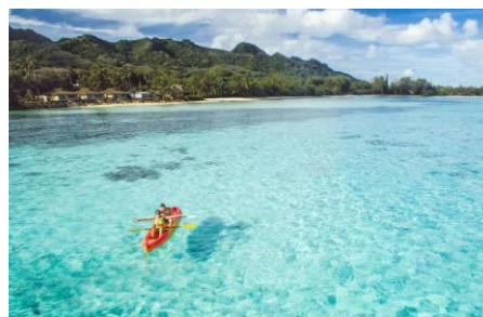
Enjoy kayaking in the lagoon