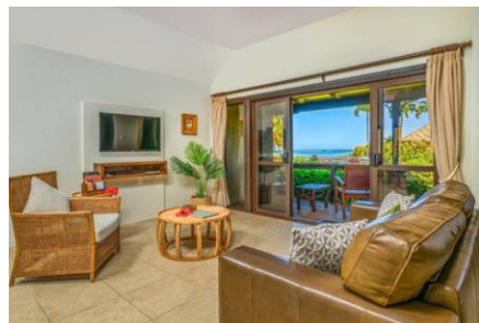
LAGOON VIEW VILLAS