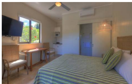
Private Day Room