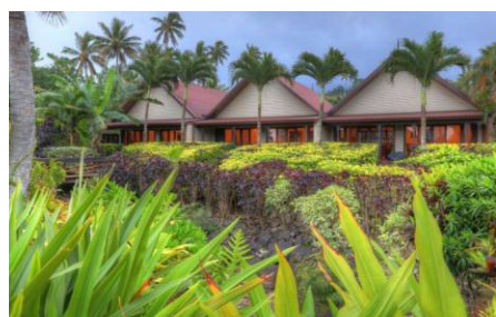
Lagoon View Villas