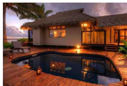
DELUXE BEACHFRONT VILLA