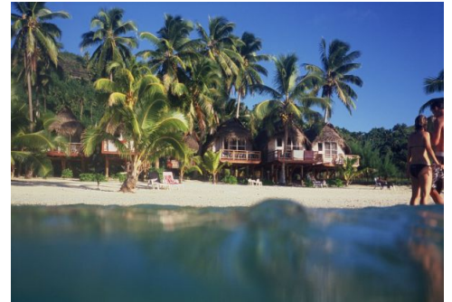
Paradise Cove - Right On The Beach

This is a great value for money property for those budget conscious travellers. For those looking for something closer to the water, the Beachfront Bungalows are as close as you can get. Nightly rates inclusive of Tropical breakfast daily.