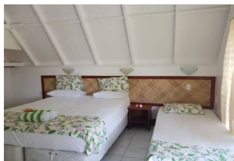
BEACHFRONT BUNGALOW INTERIOR