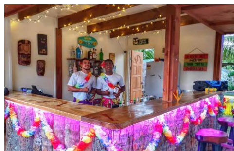
THE COVE BAR