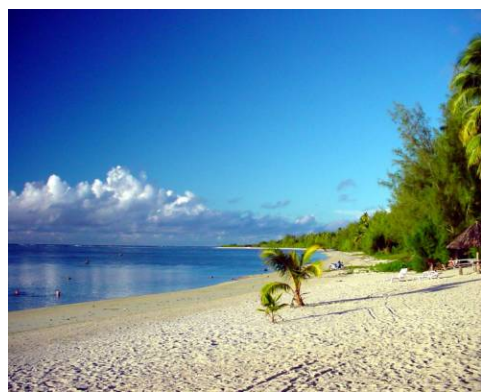
STUNNING LAGOON VIEW