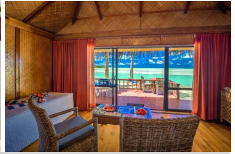
DELUXE BEACHFRONT BUNGALOW