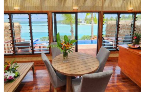
BEACHFRONT PRIVATE INFINITY POOL VILLA