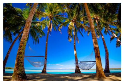
RELAX ON A HAMMOCK BY THE BEACH