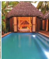
ROYAL HONEYMOON POOL VILLA (PRINCESS TE ARAU)