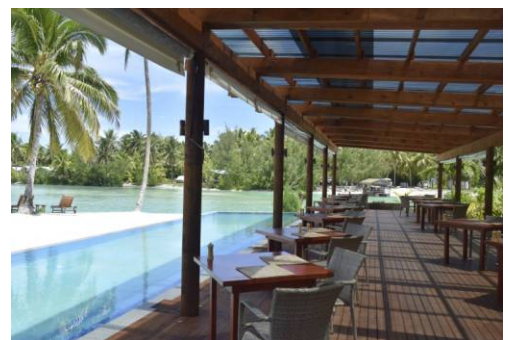
RELAX BY THE POOLSIDE WHILST ENJOYING THE LAGOON VIEW