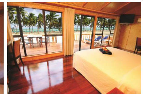
PREMIUM BEACHFRONT BUNGALOW