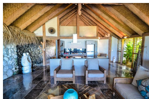
1 Bedroom Beachfront Villa