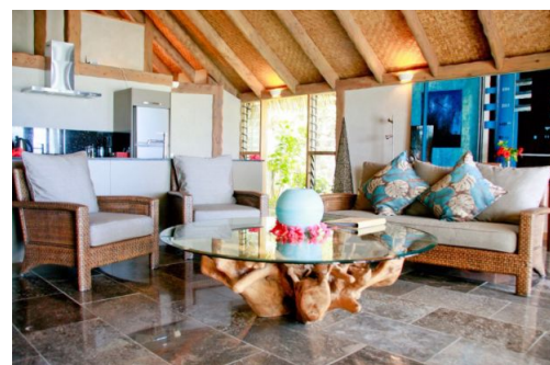
1 Bedroom Beachfront Villa