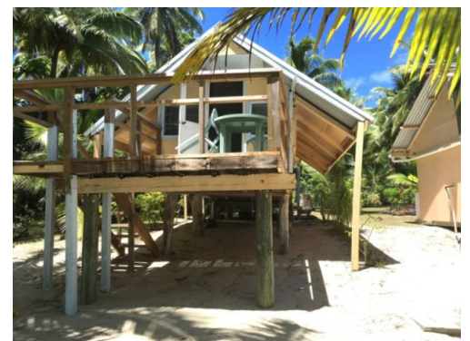
SMALL BEACHFRONT BUNGALOW