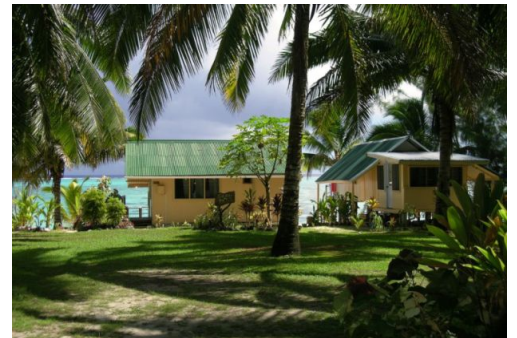
VAIKOA BEACH UNITS

Vaikoa Beach Units is a worthy holiday option, ideal for the budget minded traveller, couples or small groups. Within walking distance to restaurants, takeaways, and a local grocery store you wont be disappointed.