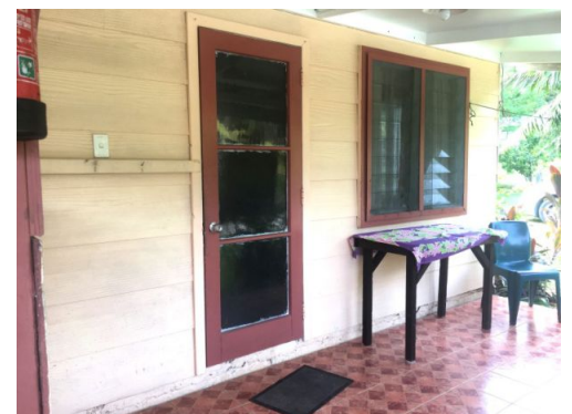
STUDIO GARDEN UNIT