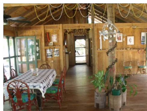
LOUNGE AND DINING AREA