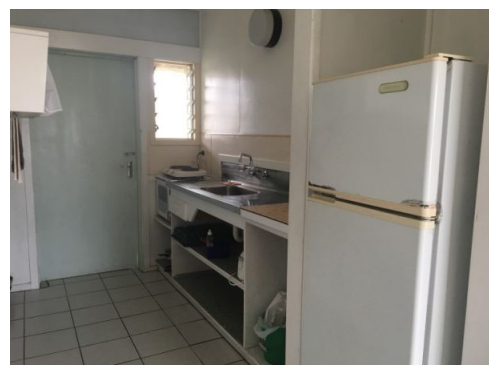
BASIC KITCHEN FACILITIES