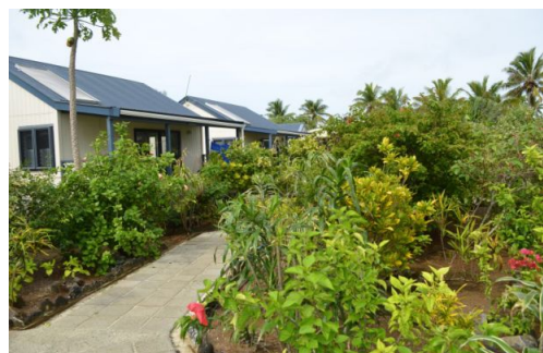
Tropical walkway to the Units

During your stay do take the time to relax on the deck and soak up the beauty that is Aitutaki or take a short walk to O'otu beach for swimming, snorkelling, or kayaking using some of the hotels' complimentary equipment.