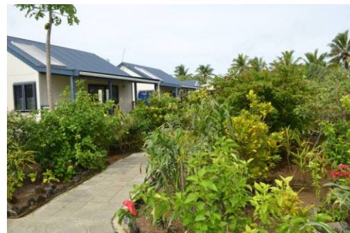
Walkway to the private villas

With vehicle rentals and a tour desk located onsite, guests can easily explore nearby attractions, including one of the island's most impressive snorkelling sites. Popoara Ocean Breeze Villas is an ideal choice for budget-conscious travellers seeking comfort, tranquillity, and authentic island charm at an affordable price.