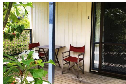
Self-contained villa exterior