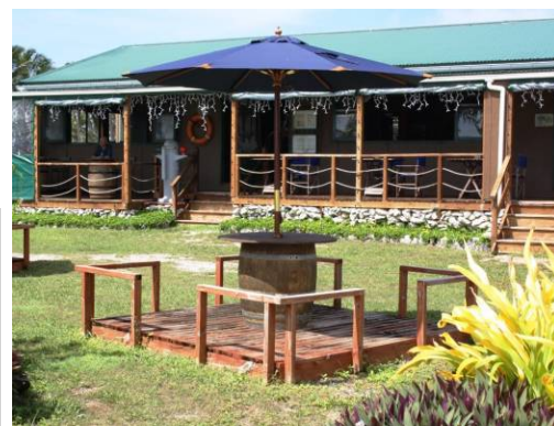
The Boat Shed