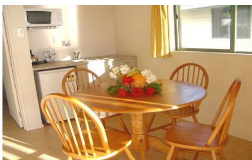
Dining & Kitchen Area