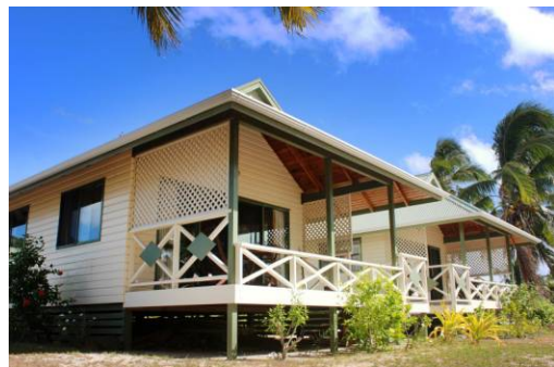
Your Bungalow awaits you...