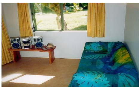
Double sofa bed