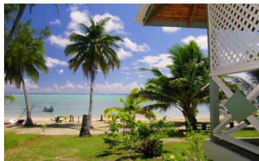
Lovely view to lagoon & beach