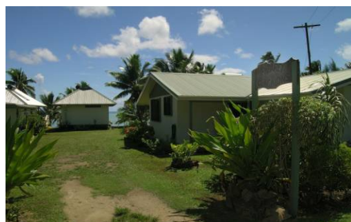
View from the road...