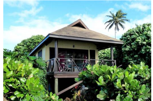
Muri Beach Cottage awaits...