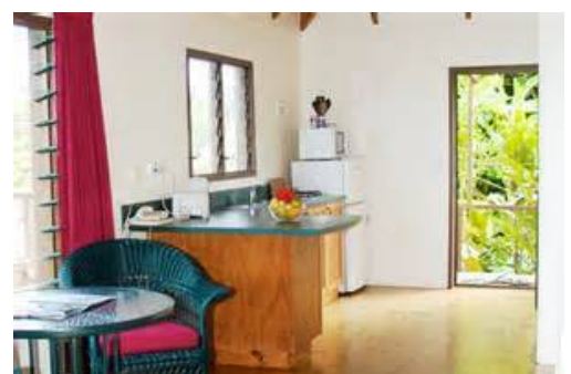
Simple kitchen interior