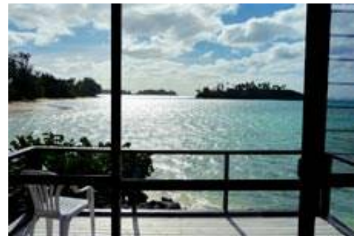
Amazing lagoon view