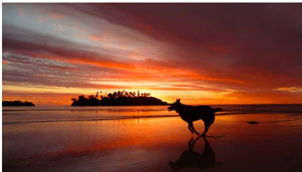
...Here you get spectacular views of the sunrise...

Also located at the waters edge providing excellent views of Muri Lagoon and the 3 motu's, is the Pole House which comprises a loft with a queen size bed and one single bed downstairs. Please note that access to the loft is by a ladder therefore not suitable for elderly persons. All the necessities are provided including full kitchen facilities, a private shower and toilet and washing machine, you wont be disappointed.