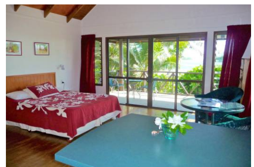
Vibrant interior of the cottages