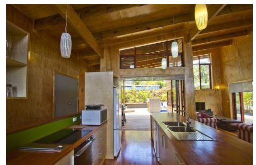
The Kitchen has everything you need