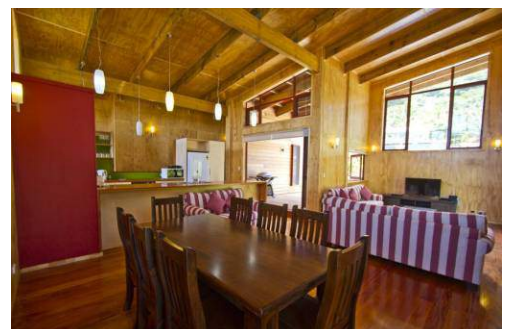
Large kitchen, dining & lounge area