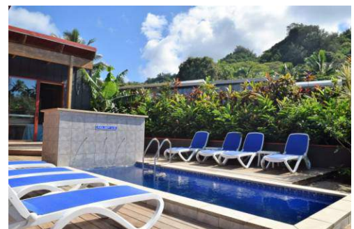
Stunning views of the mountains