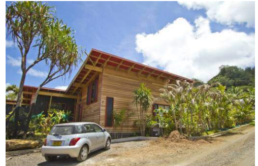
Home from the driveway

Paradise Holiday Homes is the perfect choice for anyone looking for a superior home away from home that is set in a very peaceful location, and surrounded by nature's tropical best. It's also the ideal property for small wedding parties, or groups of up to 32 people travelling together.