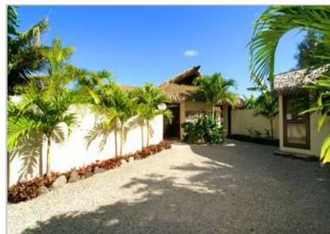
Make your way to your very own villa...

This is the perfect upmarket property for those wanting to get away from it all . Great for honeymooners or wedding couples looking to experience a special vacation away from home.