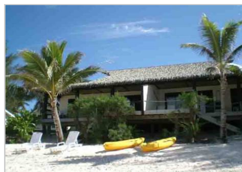
Look out to the lagoon from your bungalow