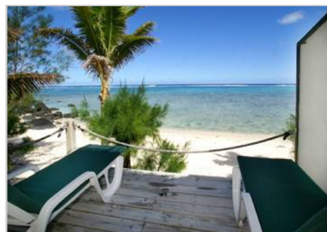
Sit back, relax and enjoy the view