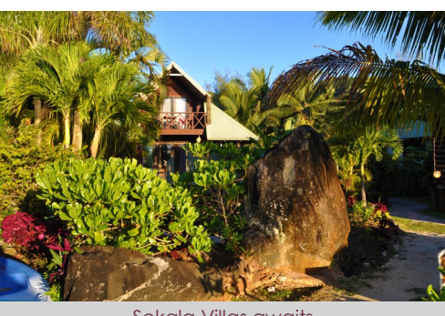
Sokala Villas awaits

This is an ideal property for those looking for a tranquil and quiet setting on the edge of beautiful Muri lagoon.