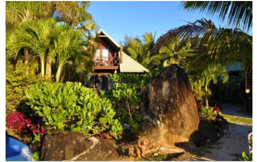
Sokala Villas awaits

This property is perfect for those seeking a tranquil, quiet retreat on the edge of the breathtaking Muri lagoon.