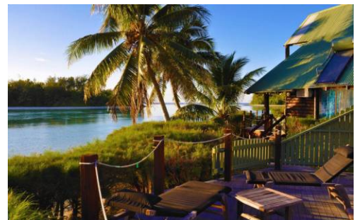
Stunning evening views