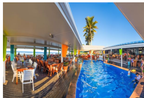
THE ISLANDER HOTEL

Daily Tropical Breakfast and Complimentary Airport Transfers for stays of 3 Nights or More