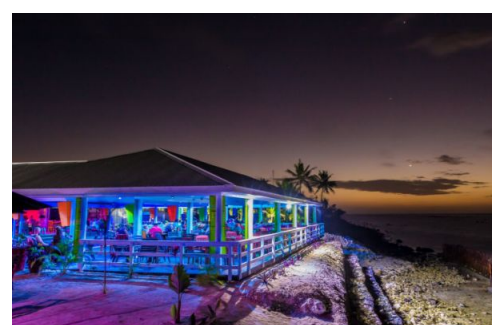
TIKI TERRACE AT NIGHT