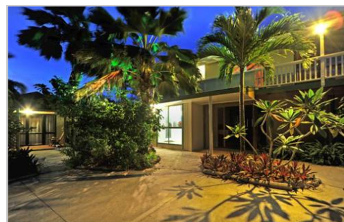
Cooks Oasis awaits...

Cooks Oasis Holiday Villas is a great choice for families or small groups travelling together including wedding parties, and is well suited for children with its family oriented environment.