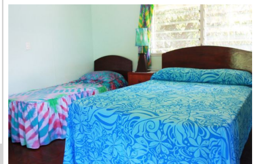
LOVELY ISLAND BEDDINGS