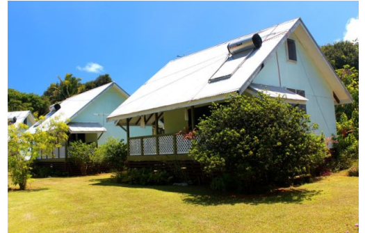
GINA'S GARDEN LODGES

During your stay do take time to explore the island on a rental car or bicycle to visit the popular tourist sites as well as meet the locals. There are a variety of tours to choose from, many of which are water activities such as lagoon cruises, snorkelling tours, fishing charters, diving and more.