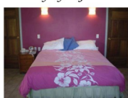
Upstairs Master Bedroom: Overlooking the water, the bedroom opens out onto the entertainment deck.

The property is sold either as a One Bedroom or Two bedroom Beach House.