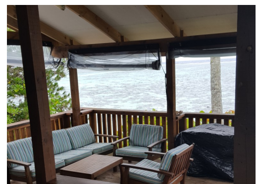
Your spacious outdoor relaxing area...