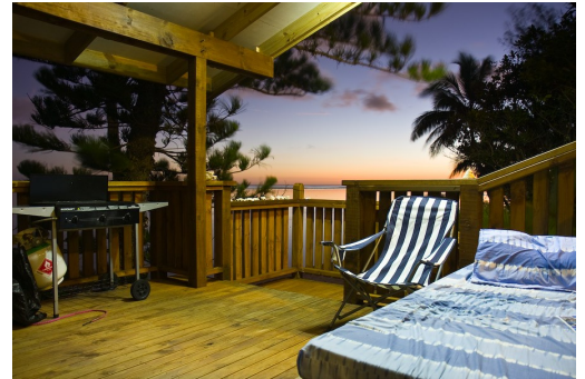
Arapati Beach Bach awaits you

Arapati Beach Bach is in one of the quietest parts of Rarotonga with the cleanest and least populated white sandy beach perfect for swimming and snorkelling.