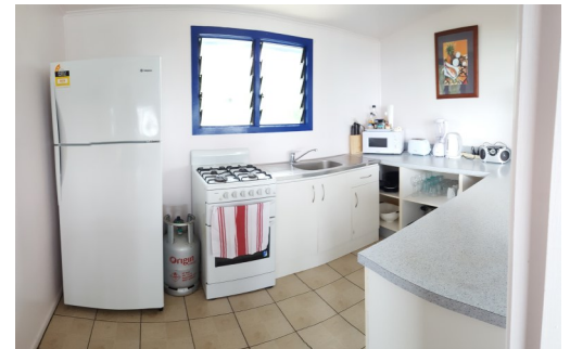
Simple & fully equipped kitchen area