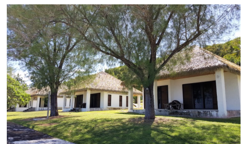
View from the Sea Wall