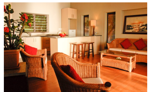
Villa Lounge & Kitchen