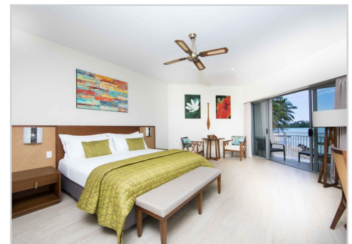
Deluxe Lagoon Studio Room