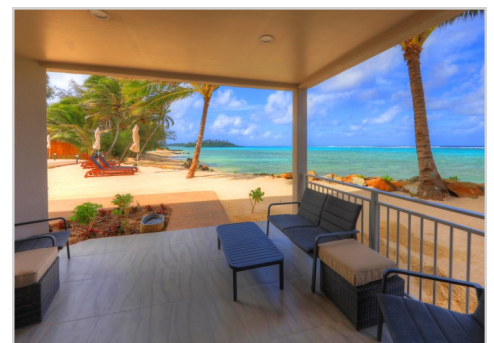
Deluxe Lagoon Studio ground level

Tropical breakfast daily at on-site Restaurant & free use of snorkelling gear & kayaks