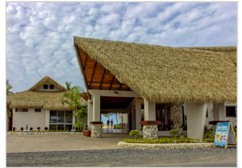
Moana Sands Lagoon Resort Entrance

Moana Sands Lagoon Resort is a great choice for couples seeking a romantic getaway in the tropics.