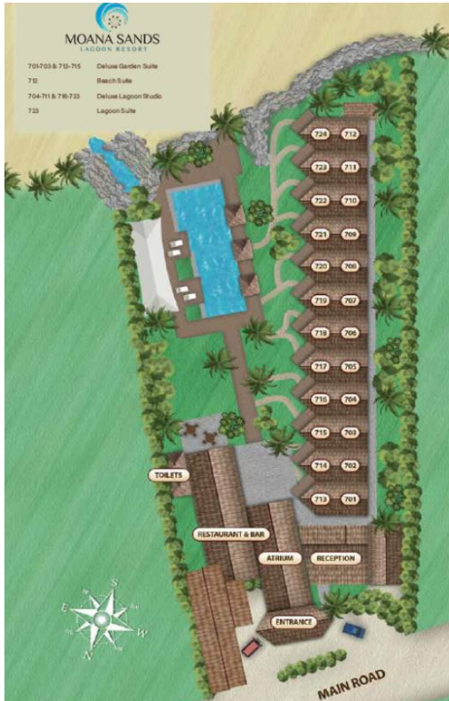
DELUXE GARDEN & LAGOON STUDIO ROOM LAYOUT