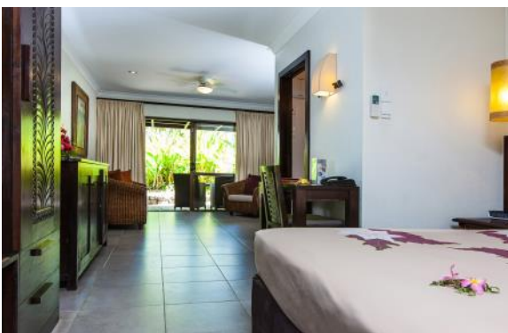
PREMIUM GARDEN SUITE