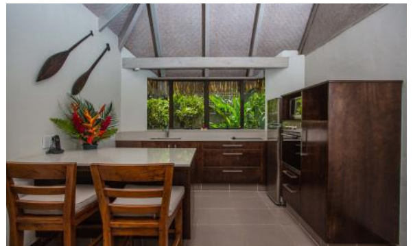
PREMIUM GARDEN VILLA (2 BEDROOM)