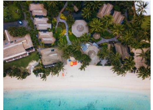
PACIFIC RESORT RAROTONGA

Daily Tropical/Continental Breakfast, Free use of Standup Paddleboards, Kayaks, Snorkelling Gear, Beach Towels, Sun Loungers, Scheduled Daily Activities at the Beach Hut, Free Kids Club (6-12 years), Daily Guest Welcome Orientation