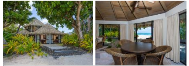
PREMIUM BEACHFRONT VILLA