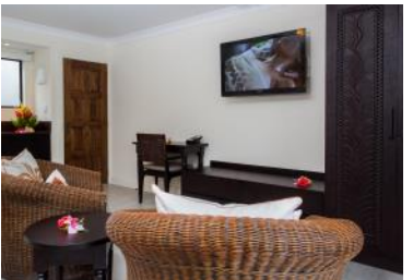
STANDARD FAMILY ROOM (OPEN PLAN)