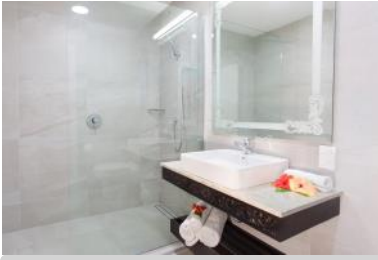
STANDARD STUDIO ROOM