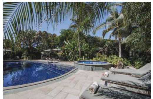
FAMILY FRIENDLY SWIMMING POOLS