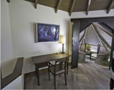
PREMIUM LAGOON VIEW VILLA (3 BEDROOM)