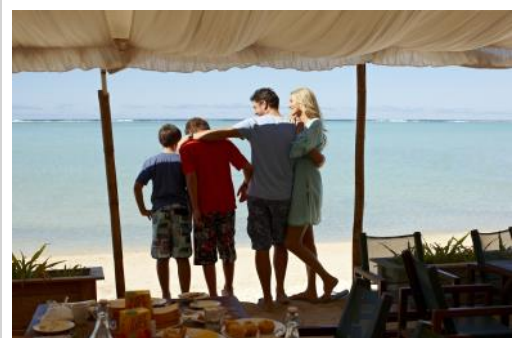
FAMILY FRIENDLY RESORT