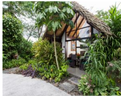
PREMIUM FAMILY ROOM (STUDIO OPEN PLAN)