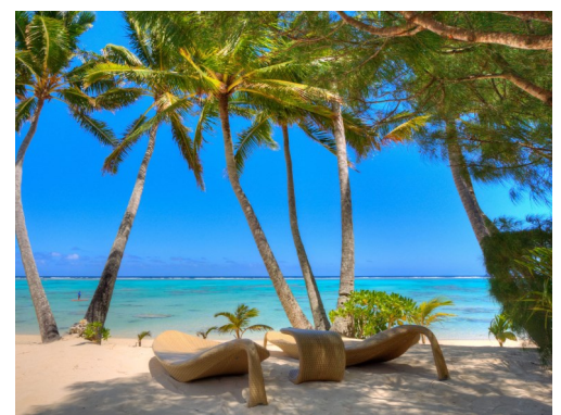
RELAX ON THE BEACH