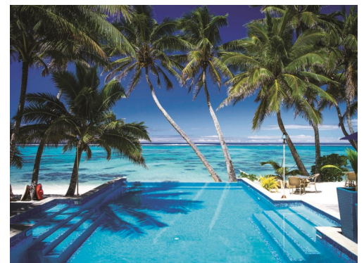
SALTWATER INFINITY POOL