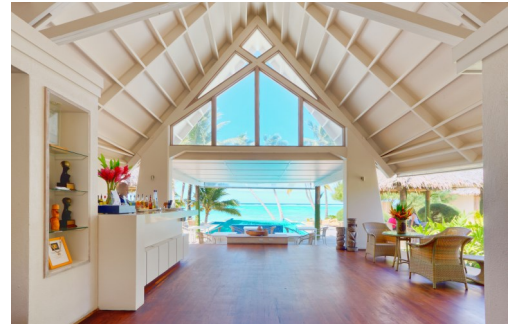
MAIN ENTRANCE AT LITTLE POLYNESIAN

Daily Tropical Breakfast, Tropical Welcome Drink & Scented Cold Towels and Complimentary use of Snorkelling Gear, Kayaks & Standup Paddleboards.