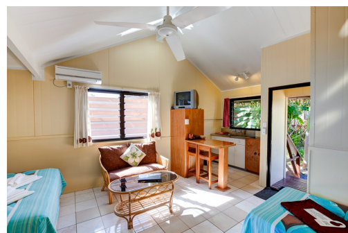
Vibrant interiors and furniture