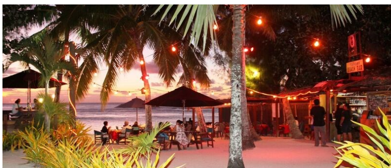
Ultimate Beachfront & Sunset Views