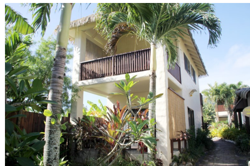
Your Villa awaits you...

The property is centrally located in the village of Arorangi. Restaurants, grocery stores and small retail outlets are all within walking distance of the property.