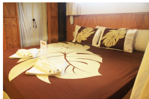
Beautiful island style beddings