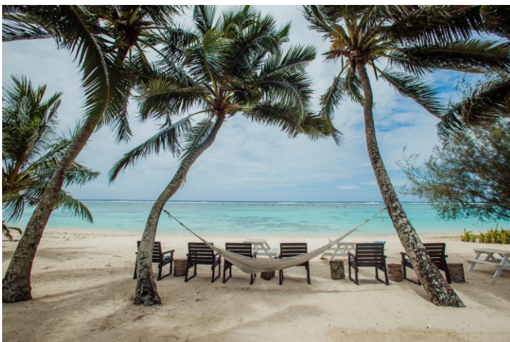
...Has a stunning Beachfront View...