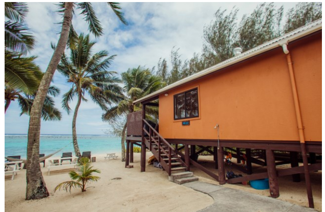
Your bungalow awaits...

Available across the road is a 24 hour petrol station, pharmacy and DVD rental store. This property is perfect for families or for couples looking for a private getaway.