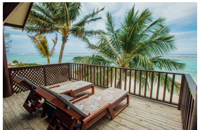
Toko Rima Studio overlooking the lagoon