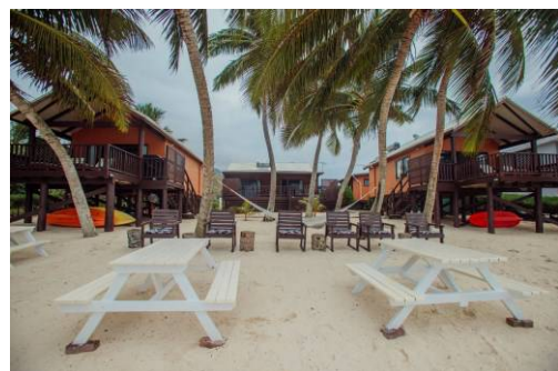
Excellent beach facilities