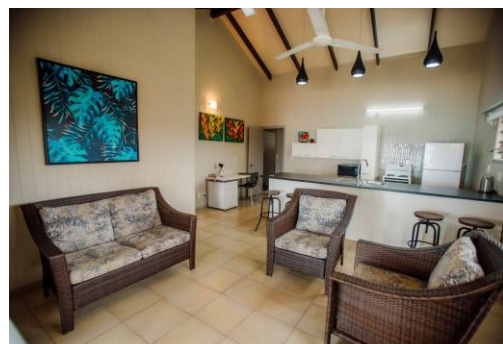
2 Bedroom Villa lounge area