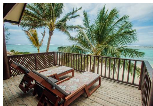
Studio overlooking the lagoon