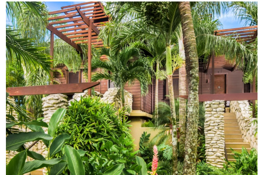
TE VAKAROA VILLAS

Te Vakaroa Villas is the ultimate choice for couples or adult families. Being centrally located, the villas offer easy access to outside conveniences such as restaurants, cafes, night market, grocery stores, water sports activities and more.