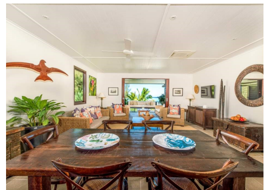
EXQUISITE POLYNESIAN DÉCOR