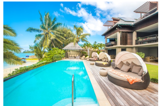
GREAT OUTDOOR RELAXATION