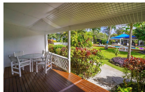
Cabana Room Exterior

The Black Pearl at Puaikura is a haven for those wanting an intimate and relaxing environment where the emphasis is on a friendly personal service.