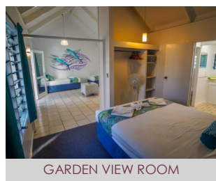
GARDEN VIEW ROOM