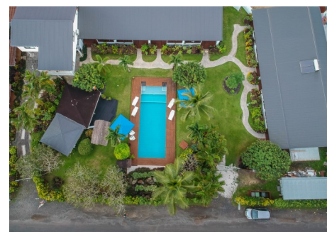
Aerial shot of property