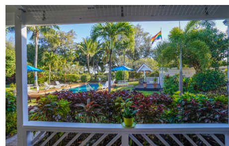
Swimming Pool from Cabana 6