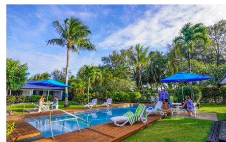
By the Pool