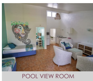
POOL VIEW ROOM