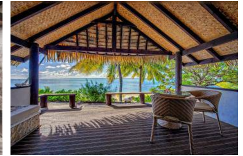
ONE BEDROOM BEACHFRONT BUNGALOW