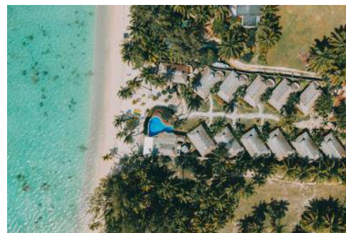
TAMANU BEACH AERIAL VIEW

Relax by the pool and enjoy a cocktail or take time to explore the lagoon through a bit of snorkelling, kayaking or swimming. The beach here is one of the best on the island. Visit the resorts' Giant Clam called "Clamentine", which is about 20 years old and rests in the lagoon just in front of the Purotu wing.