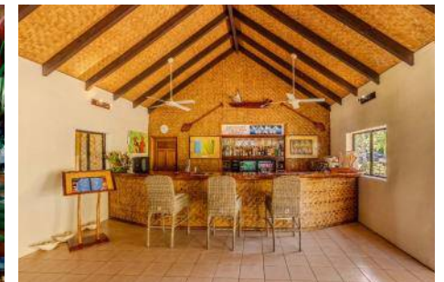
TAMANU RESTAURANT & VAKA BAR