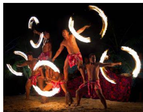
ISLAND NIGHT FIRE DANCE SHOW