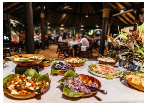
DINNER AT TAMANU RESTAURANT