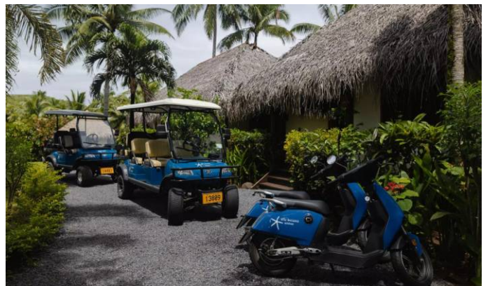
E-GOLF CARTS FOR HIRE