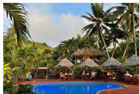
Saltwater swimming pool