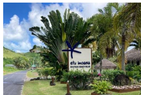
Welcome to Etu Moana

Flower neck ei & coconut water on arrival, complimentary return airport transfers, daily tropical breakfast, complimentary unlimited Wi-Fi, concierge guest service, filtered water in villas, free use of fins, reef shoes, standup paddleboards, kayaks, and bicycles. Snorkelling mask and snorkel available for purchase and e-golf carts for hire at an additional cost (subject to availability).