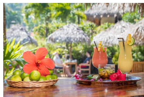
Cocktails served at the Honesty Bar