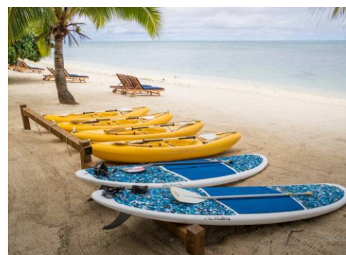
Kayaks & stand up paddleboards