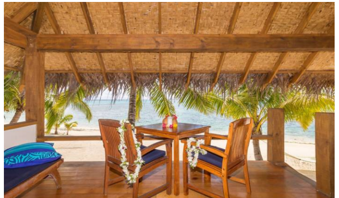
ABSOLUTE BEACHFRONT VIEW