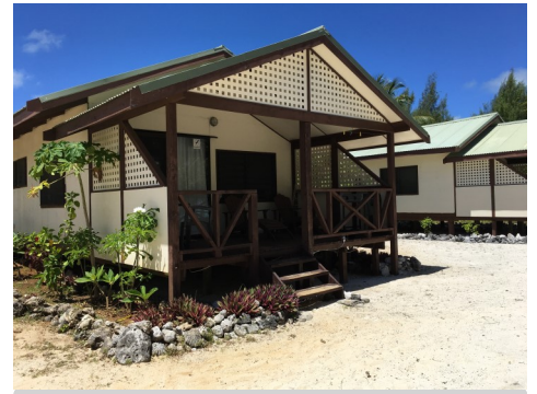
RANGINUI'S SUNSET BUNGALOWS