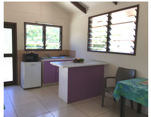
KITCHEN IN STUDIO BUNGALOW