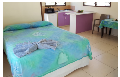
ISLAND STYLE BEDDING