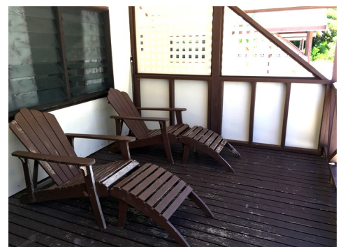
SUN LOUNGERS ON THE BALCONY