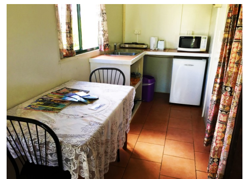
KITCHEN UNIT IN 2 BEDROOM BUNGALOW