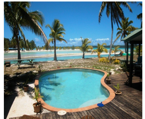
SWIMMING POOL OVERLOOKING THE LAGOON