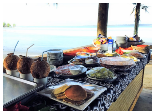
Continental Breakfast served at The Blue Lagoon Restaurant