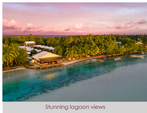
Stunning lagoon views