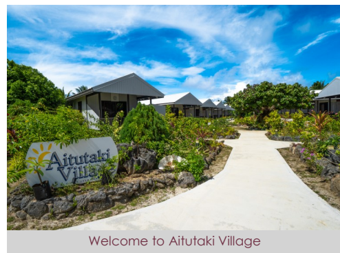
Welcome to Aitutaki Village

Aitutaki Village provides a combination of genuine local hospitality and modern comforts for to enjoy a comfortable and completely unforgettable holiday experience. It's a popular choice for not only families and business travelers, but also for couples looking to escape from their busy lives to just relax in warm tropical weather.