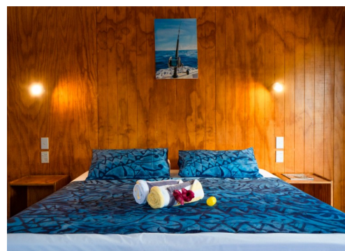
Tipani Bungalow interior