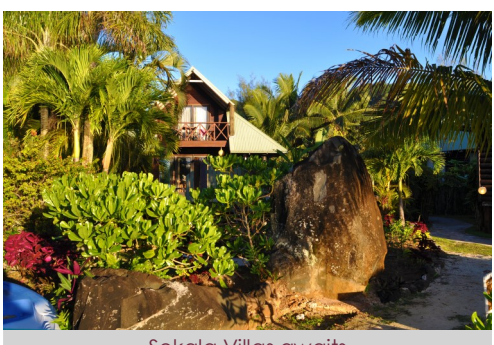
Sokala Villas awaits

This is an ideal property for those looking for a tranquil and quiet setting on the edge of beautiful Muri lagoon.